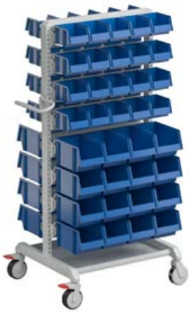
Basic trolley 1