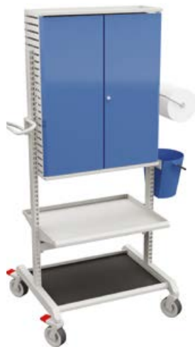
Basic trolley 4