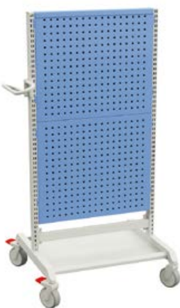
Basic trolley 5