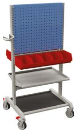
Basic trolley 2