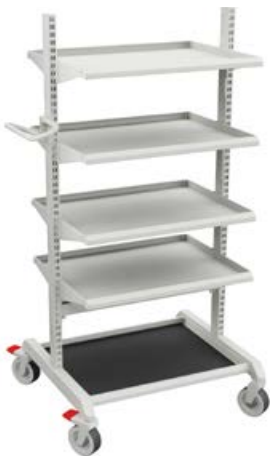
Basic trolley 3