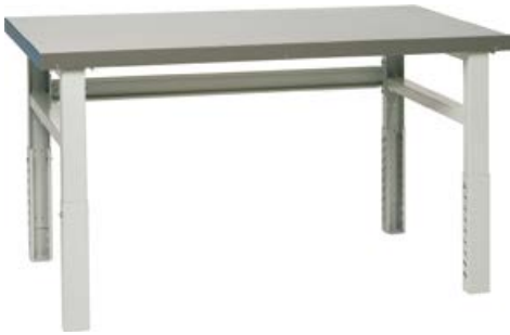
Workshop standard workbench