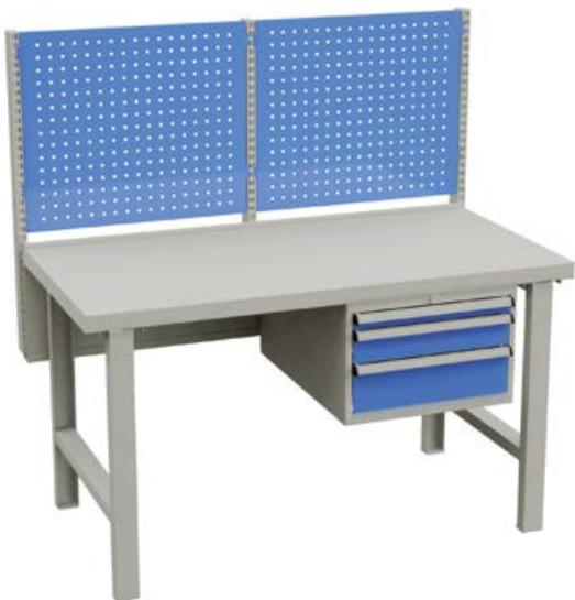
Workshop repair workstation