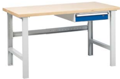
Workshop installation workstation